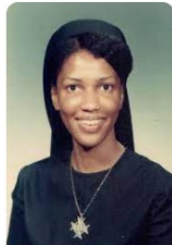
Sr. Thea Bowman

Sr. Thea Bowman became Catholic when she was nine years old. She later went to college and then became the first African American to join the Franciscan Sisters of Perpetual Adoration in Wisconsin. After 16 years of teaching at the elementary, secondary and college levels, Sr. Thea Bowman was invited to be a special consultant for the Catholic Church. She gave presentations around the country aimed at bridging racial and cultural divisions. She combined her gifts of singing and gospel preaching, with prayers and storytelling. Sr. Thea Bowman was diagnosed with bone cancer in 1984. Yet, she continued her fight against the evils that drive people apart, from her wheel chair, until her death at age 53 in 1990. Sr. Thea Bowman said she prayed "to live until I die—to live fully." And that she did.