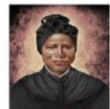
ST. JOSEPHINE BAKHITA