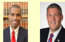
MALIK EVANS – MAYOR: CITY OF ROCHESTER