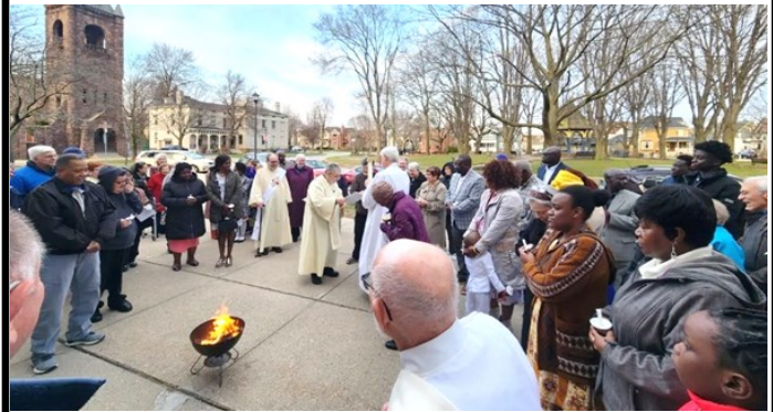
Lighting the fire at the Easter Vigil at Immaculate Conception/St. Bridget's Church.